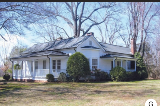
Greenway Headquarters 35° 2'47.50"N 80° 55'39.50"W