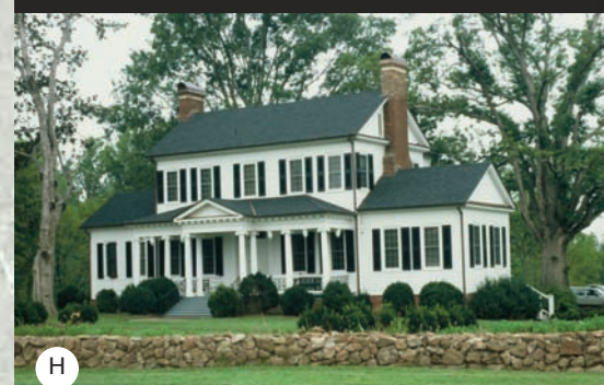
Springfield House 35° 2'54.00"N 80° 55'39.50"W