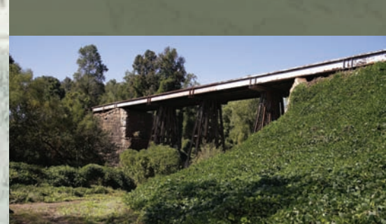
Southern Railroad Trestle 35° 1'42.50"N 80° 55'34.00"W