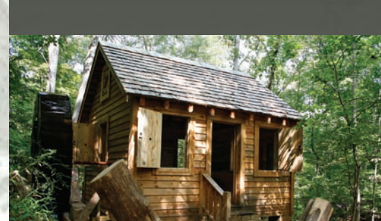
Webb Grist Mill 35° 1'26.00"N 80° 55'9.00"W