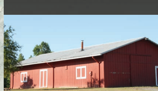
Field Trial Barn 35° 2'1.00"N 80° 55'3.00"W