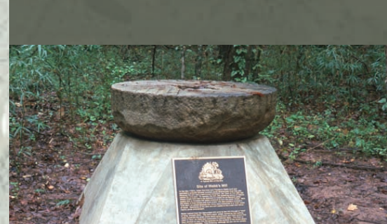
Millstone 35° 1'30.00"N 80° 55'15.00"W