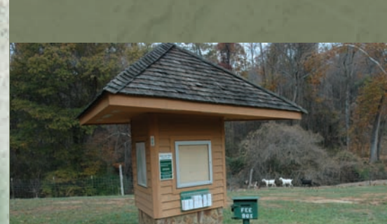
Trail Map Kiosks